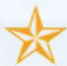
一星章 STAR I