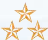
三星章 STAR III